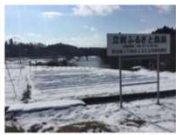
Rental farm management