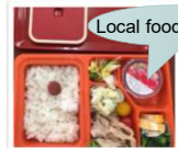
Food distribution service