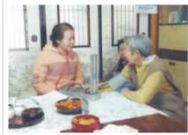
Health consultation for the elderly