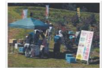
Providing opportunities for agricultural experience